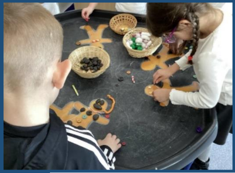
Nursery have been learning 'The Gingerbread Man'...with some snack breaks in the sunshine