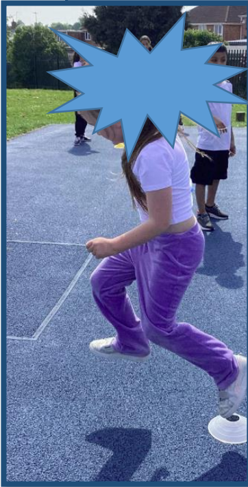
Y3 enjoying P.E. outside