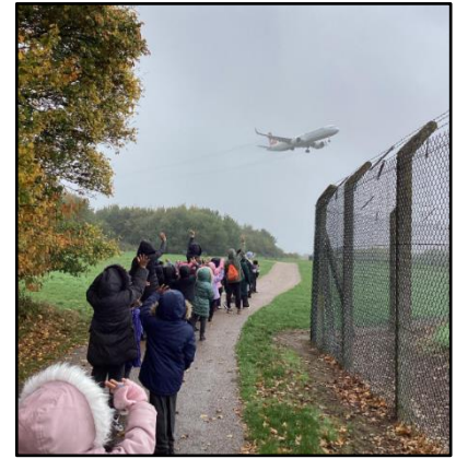
Y2 went investigating in the local area.

Bloom class went all the way to Carding Mill Valley to enrich their topic.