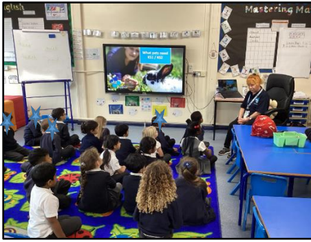
Y1 were visited by The Blue Cross who talked about caring for pets and what they do at The Blue Cross.

As part of our personal development at Elms Farm we enrich our curriculum with educational trips and visitors to the school.