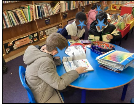
Y5 went to the local library to enjoy some reading